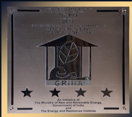
Green Building award from "GRIHA"