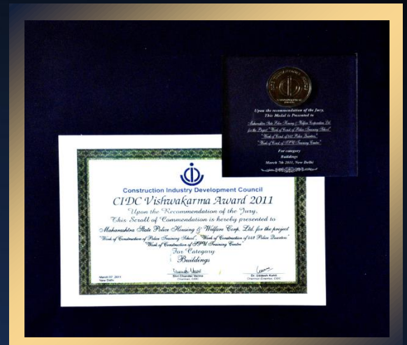
Construction Industry development council (CIDC)